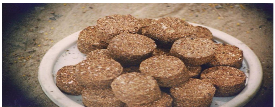
Plate 3: Briquettes produced from maize cob and cassava peel gel binder