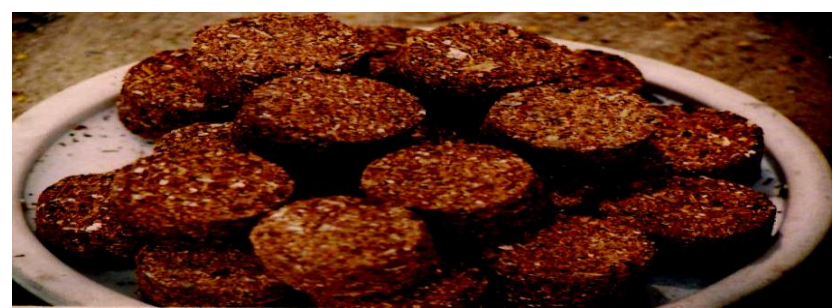
Plate 7: Briquettes produced from groundnut shell and cassava peel gel binder