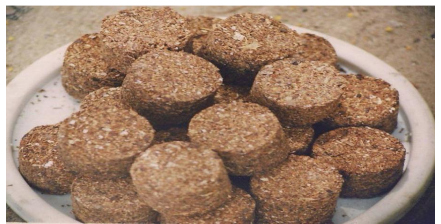
Plate 5: Briquettes produced from sugarcane baggasse and cassava peel gel binder