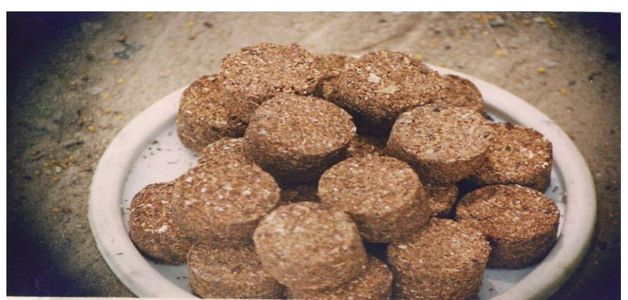
Plate 6: Briquettes produced from sugarcane baggasse and banana peel binder