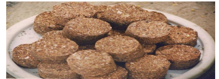
Plate1: Briquettes produced from rice husk and cassava peel gel binder