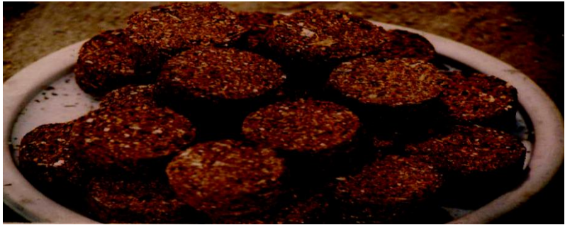
Plate 8: Briquettes produced from groundnut shell and banana peel binder