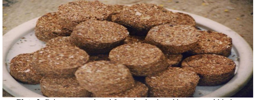
Plate 2: Briquettes produced from rice husk and banana peel binder