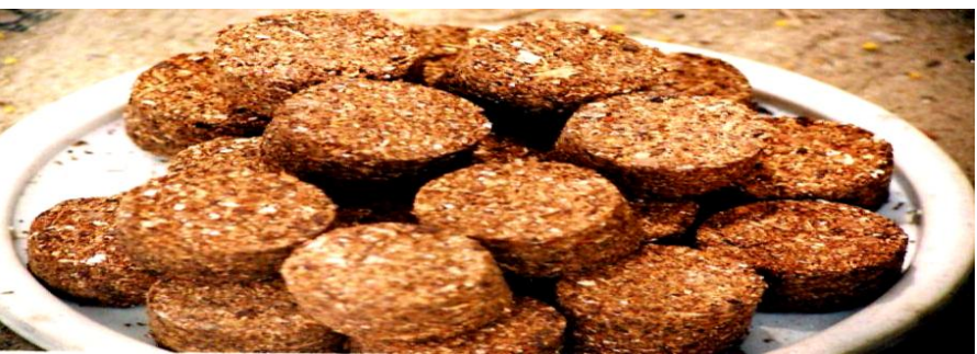
Plate 4: Briquettes produced from maize cob and banana peel binder